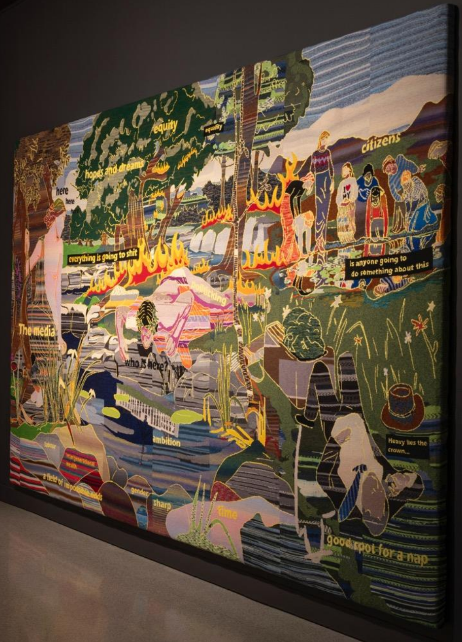
Emma Buswell, The Pool , 2024, knitted wool and lurex yarns, (installation View at IOTA24: Codes in Parallel, John Curtin Gallery) 180 x 270cm and 430 x 270cm