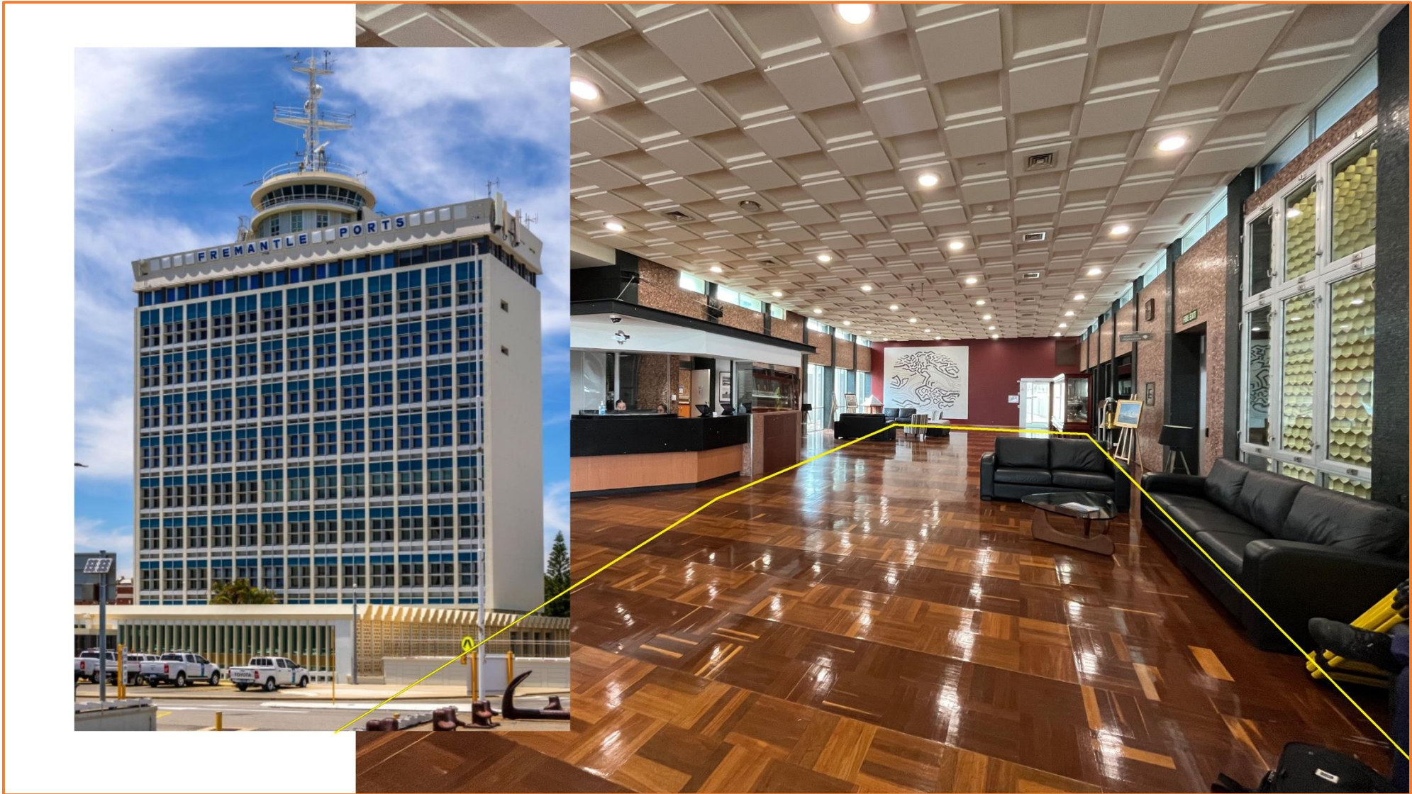
Artist Rendering of proposed installation venue including outside perspective of the Port Authority Building, Fremantle, as well as indicative footprint of the installation within the ground floor of the building