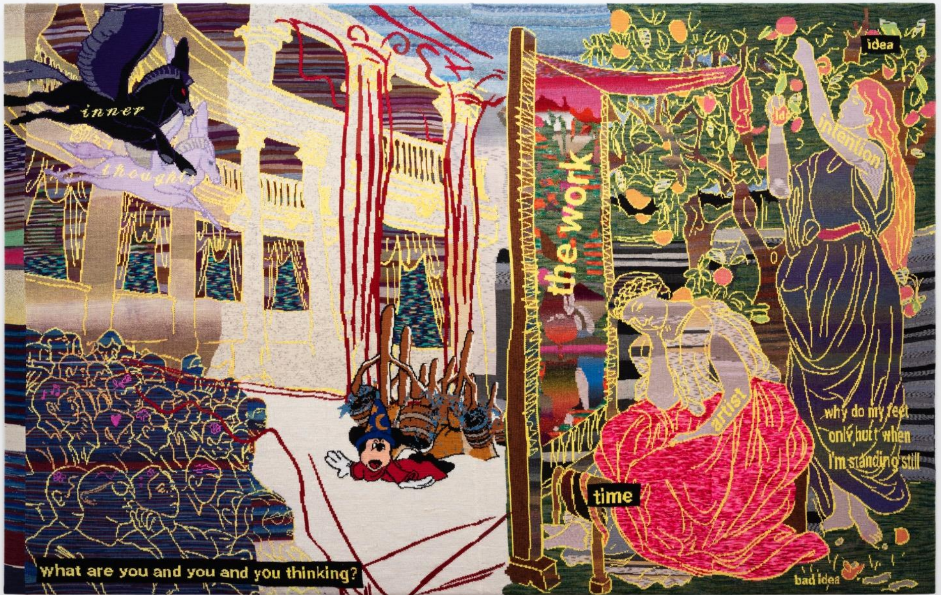
Emma Buswell, Between Draft and Final Intention , 2024, cotton, wool, lurex yarns, 160 x 220cm