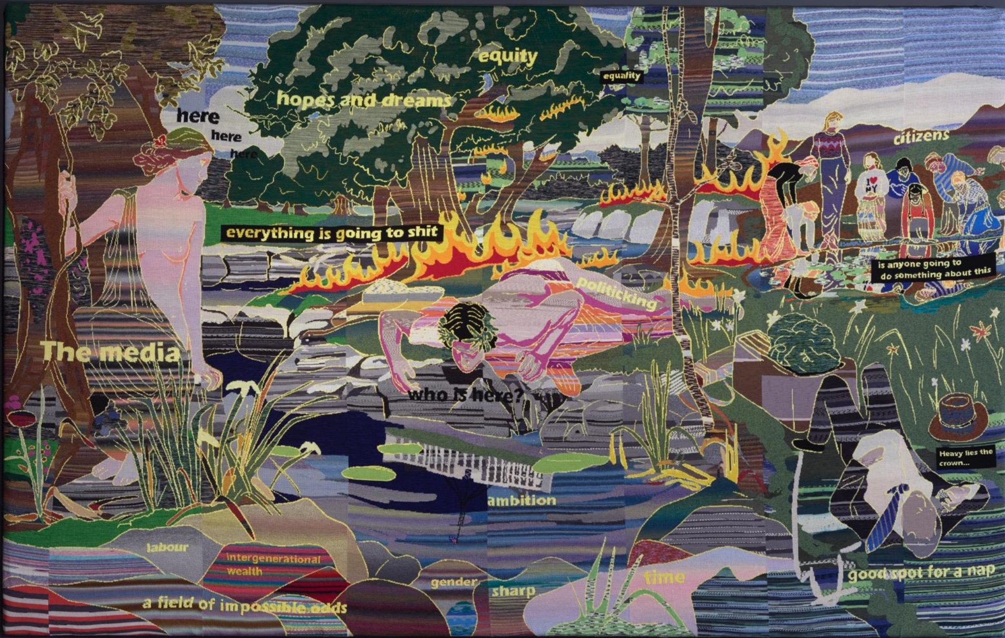
Emma Buswell, The Pool (Narcissus and Echo) , 2024, knitted wool and lurex yarns, 430 x 270cm, Emma Buswell